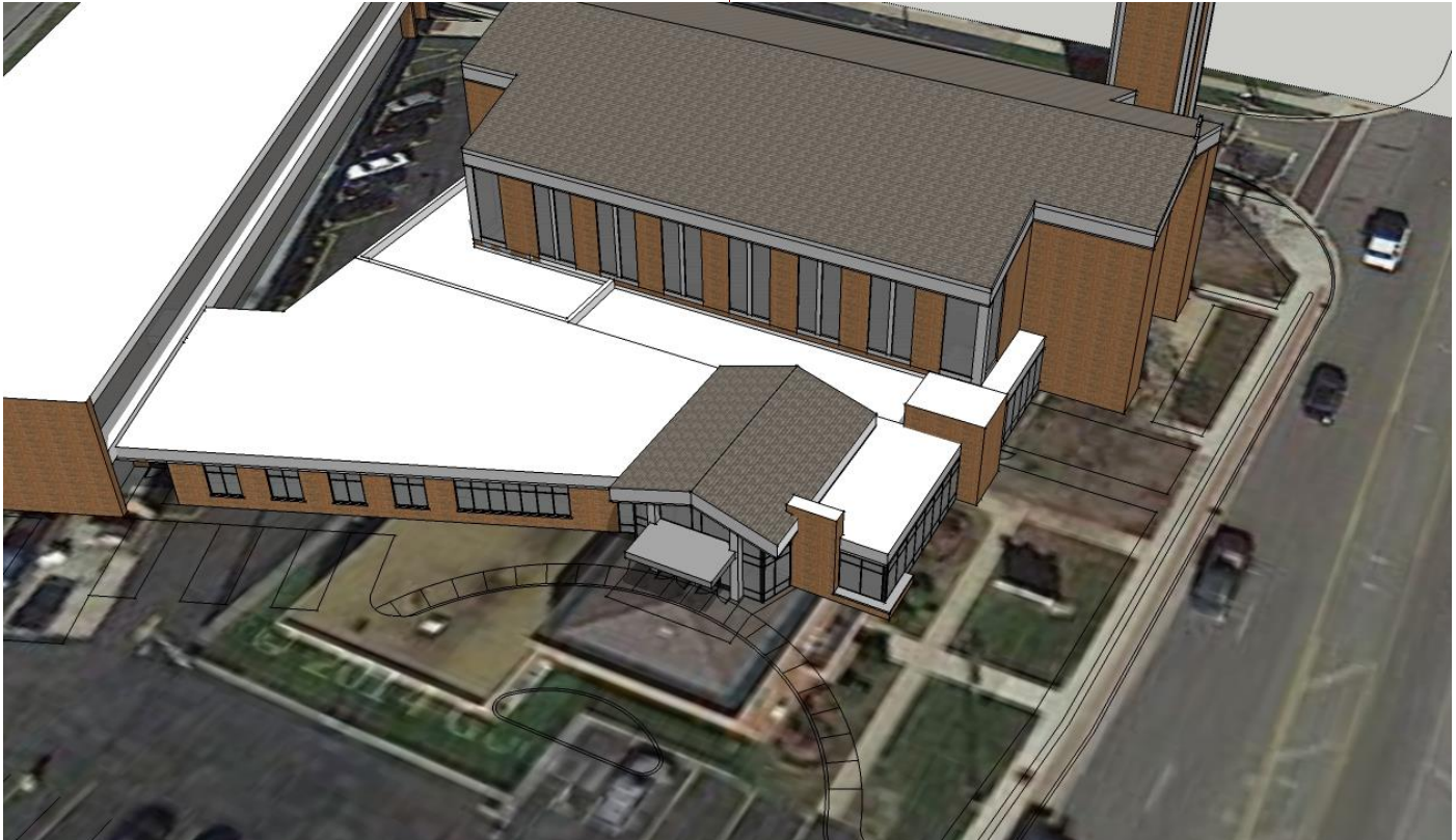
This is a concept architectural drawing of the proposed gathering space and parish office connected to the school (area with white roof south of the church). In this drawing, the new construction is overlaid on the current parish office/garage which you can see in the foreground.

Ss. Peter & Paul Catholic Church * 618-345-4343 * www.saintspeter-paul.org